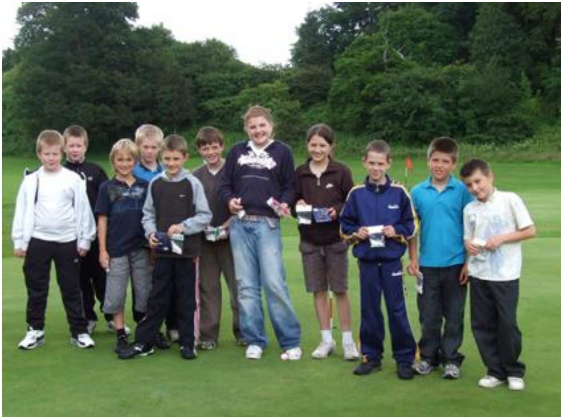
9-12 year olds