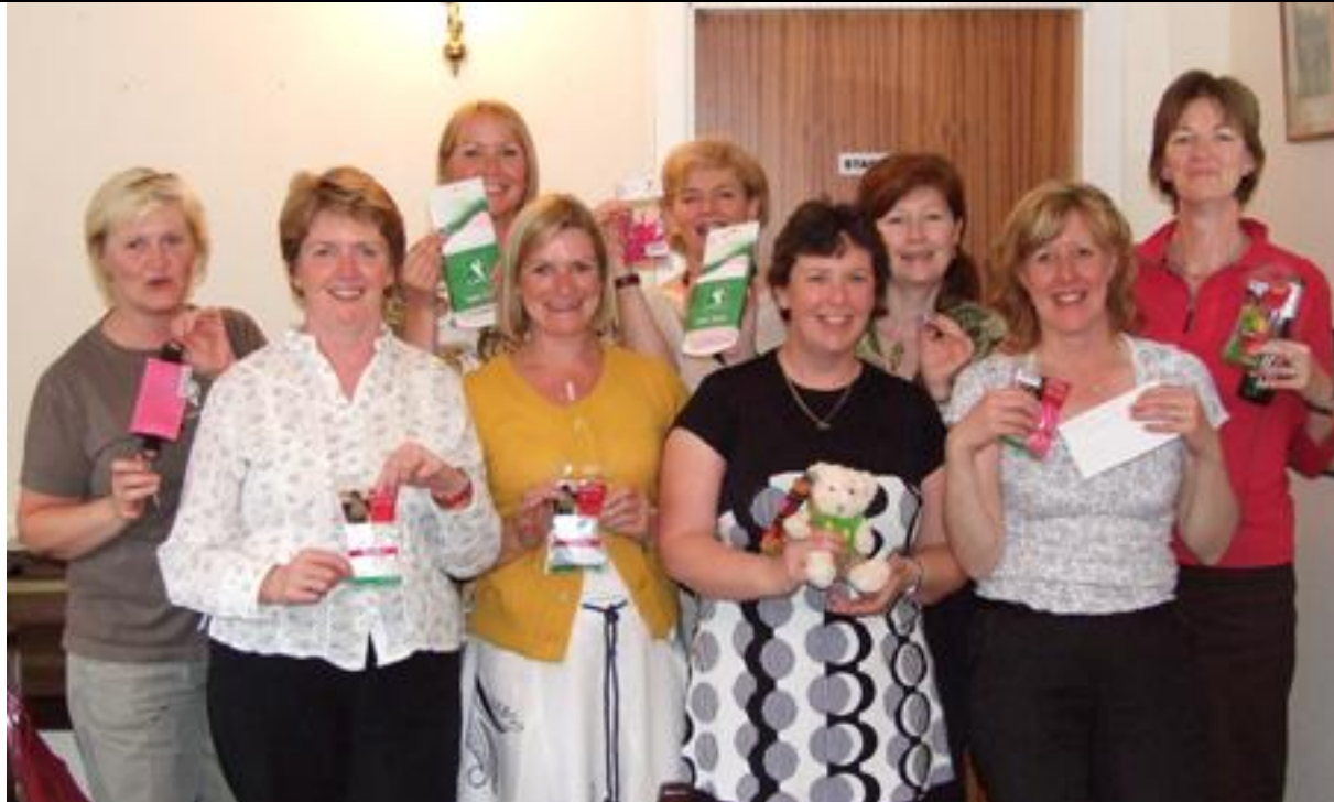
The Ladies from Carrickvale Golf Club had a great time.