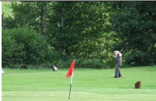
Calum tees off on hole 5