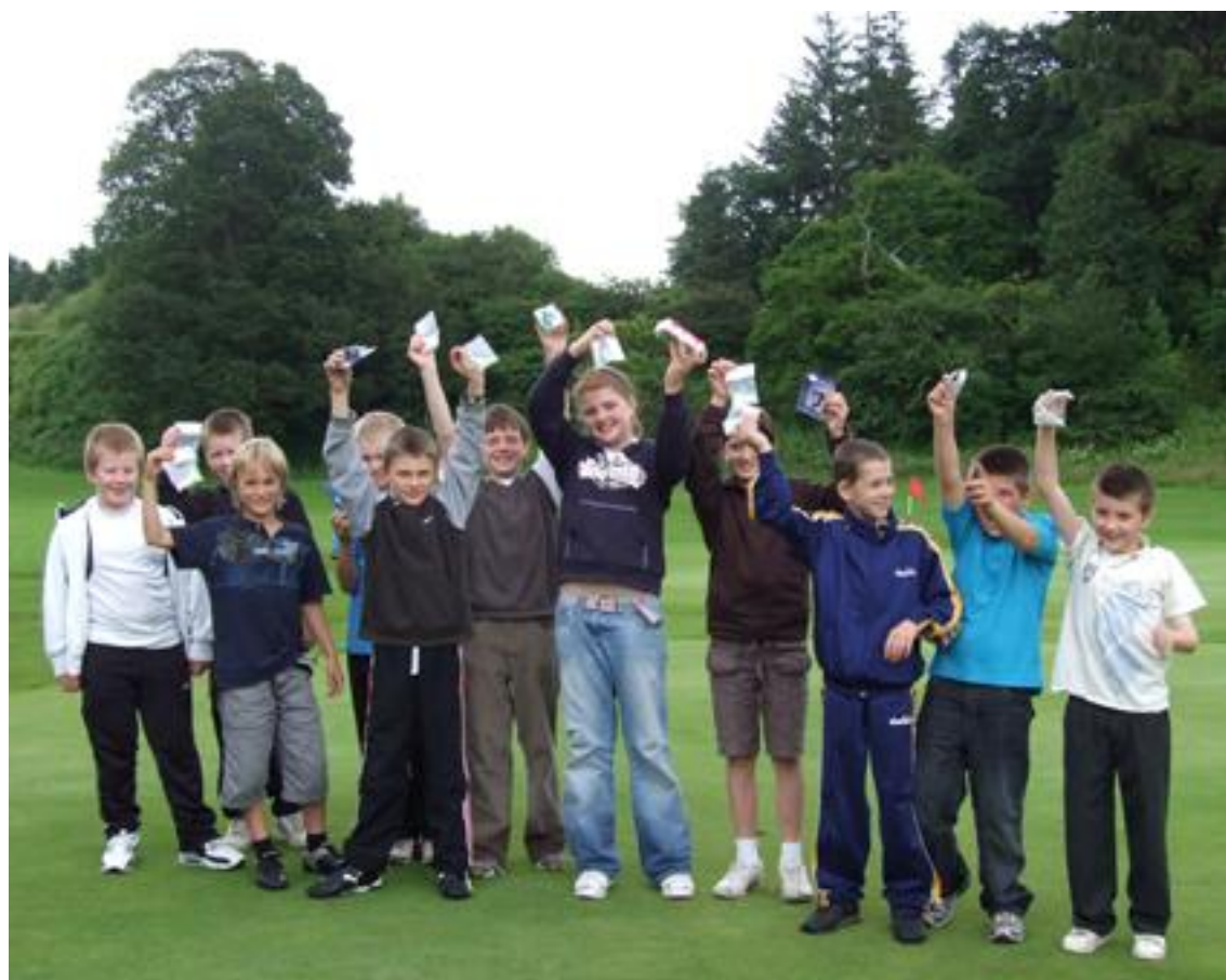
9-12 year old group celebrating