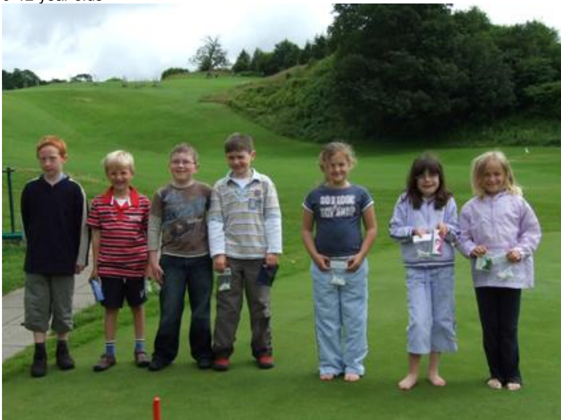
6-8 year olds