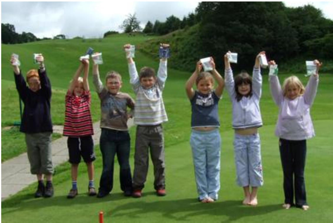
6-8 year olds celebrating