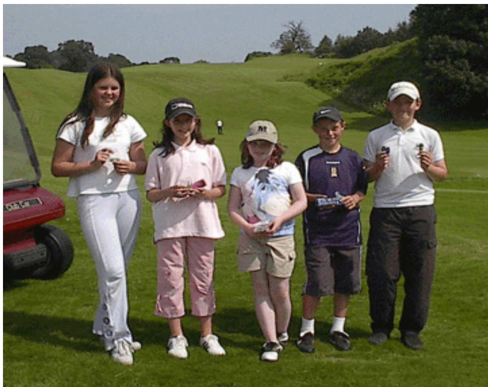
Winners from the 11-12 age group