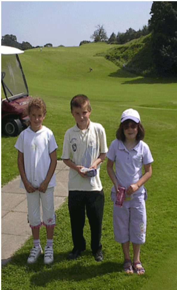
Winners from the 7-8 age group