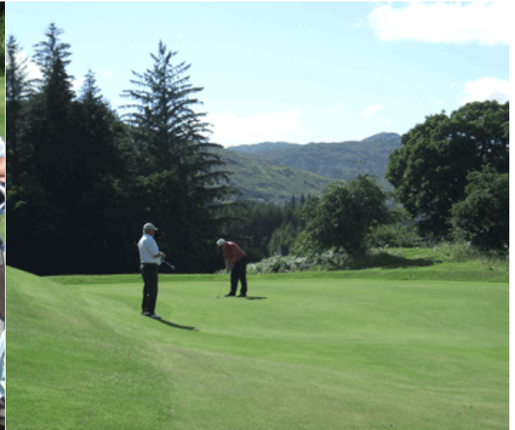
the winning putt!