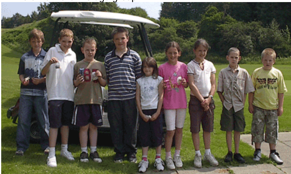
Winners and entrants from the 9-10 age group